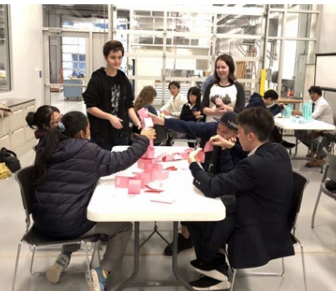
INNOVATION WORKSHOP APPLIED LEARNING