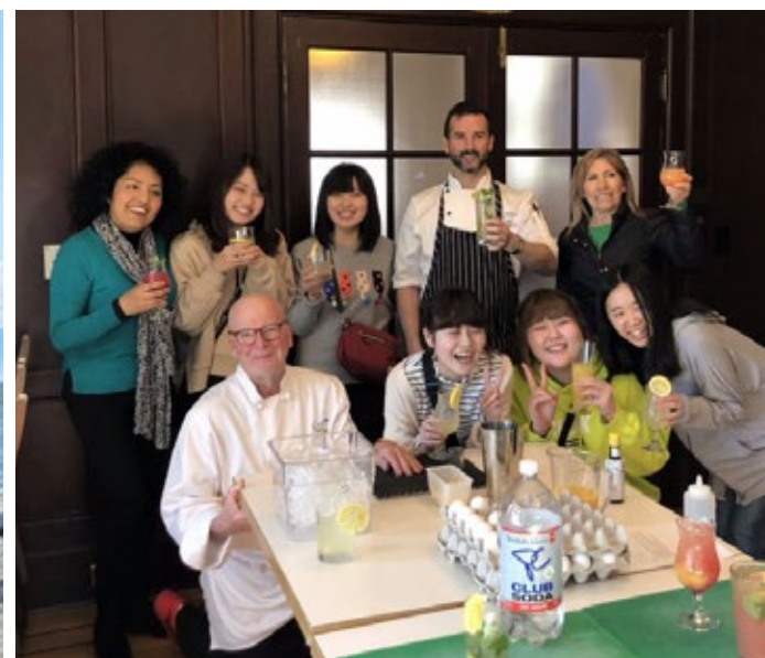
CELA STUDENTS LEARNING MIXOLOGY AT CAMOSUN'S DUNLOP HOUSE