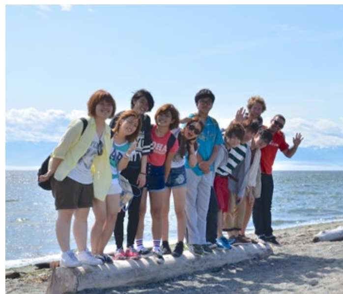
LANGUAGE & CULTURE STUDENTS ON AN EXCURSION TO ESQUIMALT LAGOON